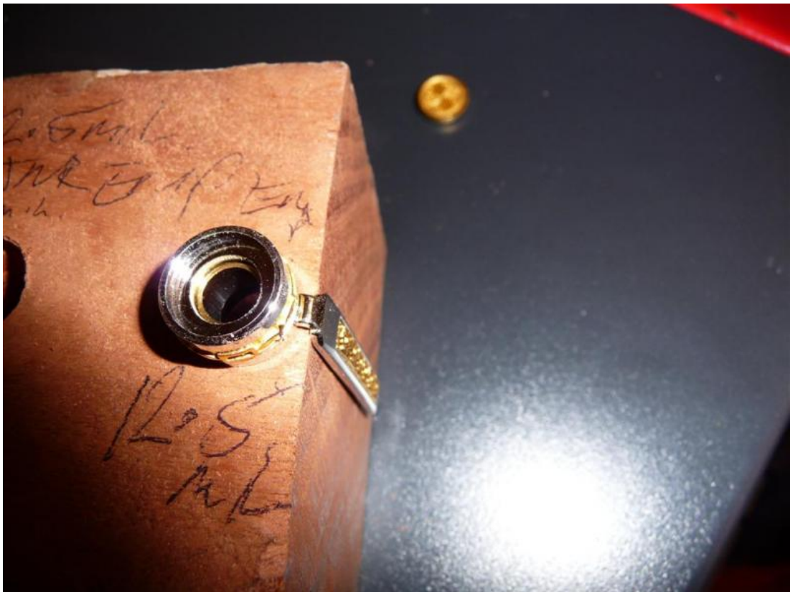
You can see small brass ring within the silver ring