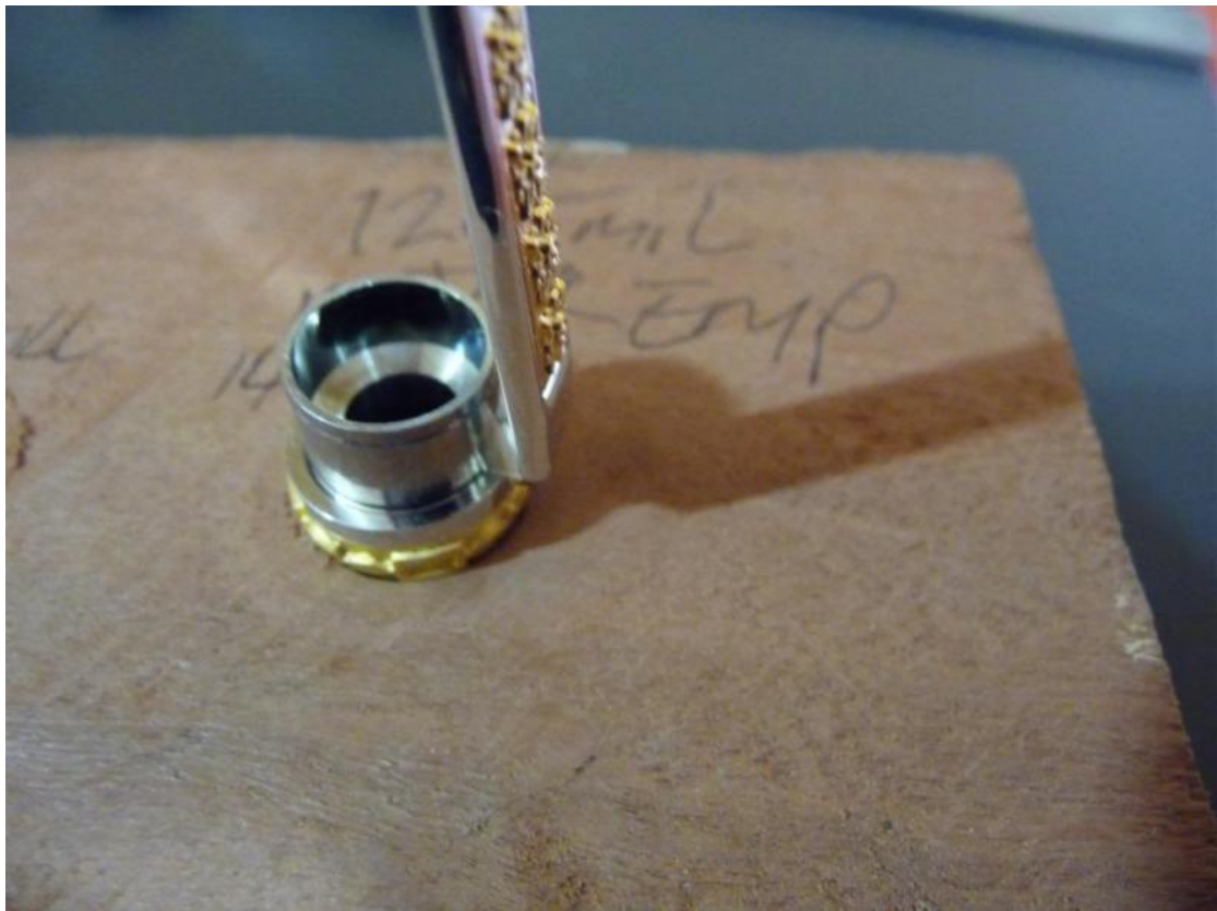
The clip in the hole use a thin rod and punch out.