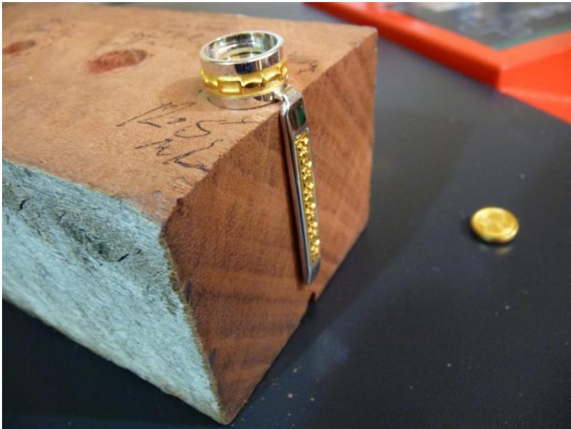
Another jig close to the end of the block a 12.5 mil hole place clip in it.