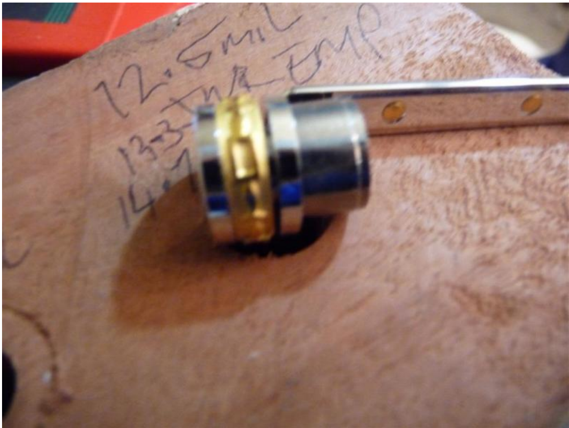
Now a small gap appears on the clip.