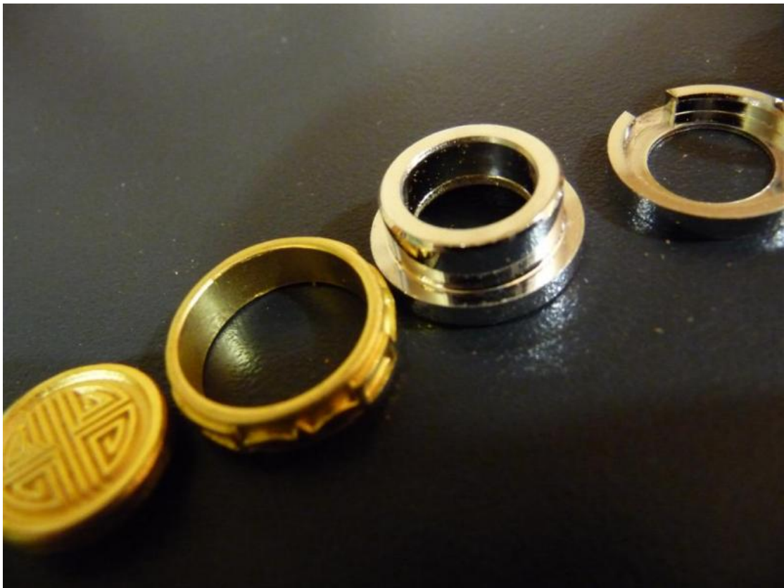
All apart close up