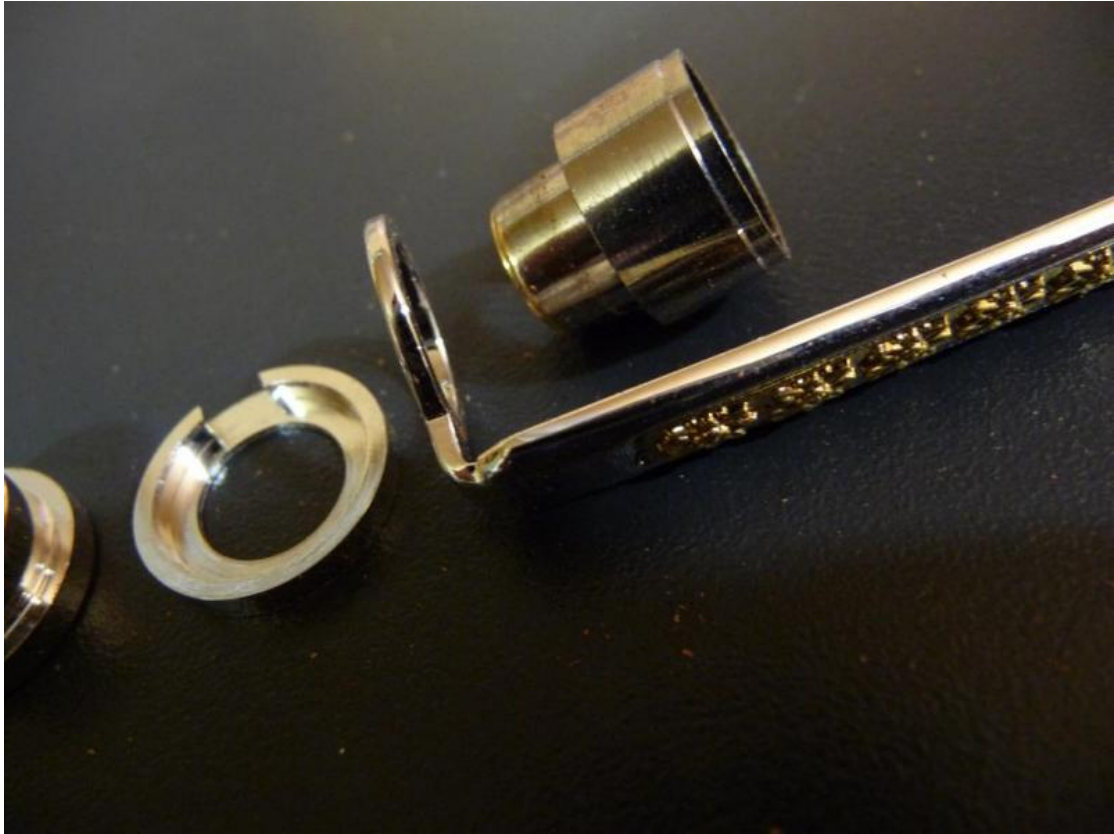
All apart close up