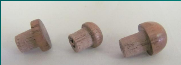
Clip end finial

Actually, any pen kit's parts can be made from these materials.