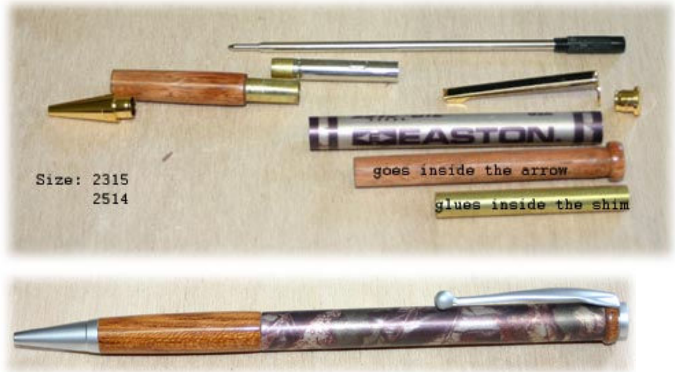
Finished pen from 2315 arrow using similar parts in the above picture

There is another size that I now like better but requires a wooden shim to be turned and inserted inside the arrow shaft. Two sizes I use are 2315 and 2514.