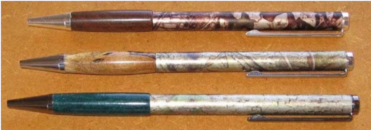
Finished pens using the smaller arrows.

How the parts fit showing the tube placements. Notice the tubes do not meet. Here is the bottom portion of the pen on the mandrel. Shape the wood section and part off to 1.45".