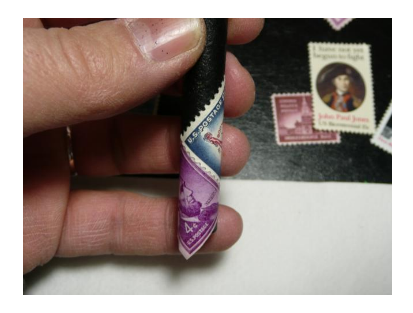
Little by little we are moving forward, until the final result