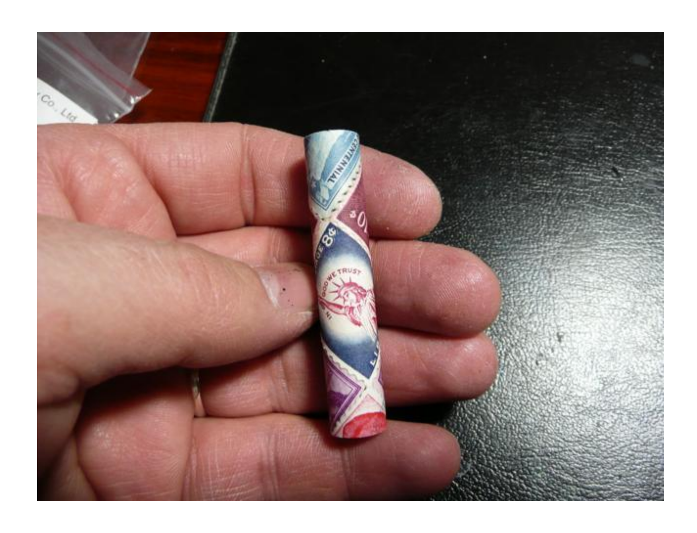
now our pen is ready for casting polyester resin.