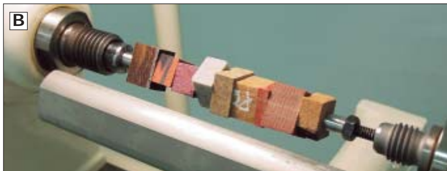
You'll save time by rough-turning an assortment of centerbands at once.

Explore the possibilities of the humble Slimline pen. It can be the basis of any number of advanced pen designs. There are only a few constants required in this kit, such as the diameter of the brass tube and the length from the end of the mechanism to the tip of the pen. Beyond that, your imagination is the limitation of this kit.