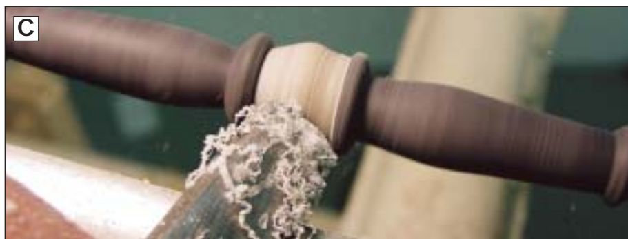
To assure pleasing proportions, turn the centerband at the same time as the barrels.